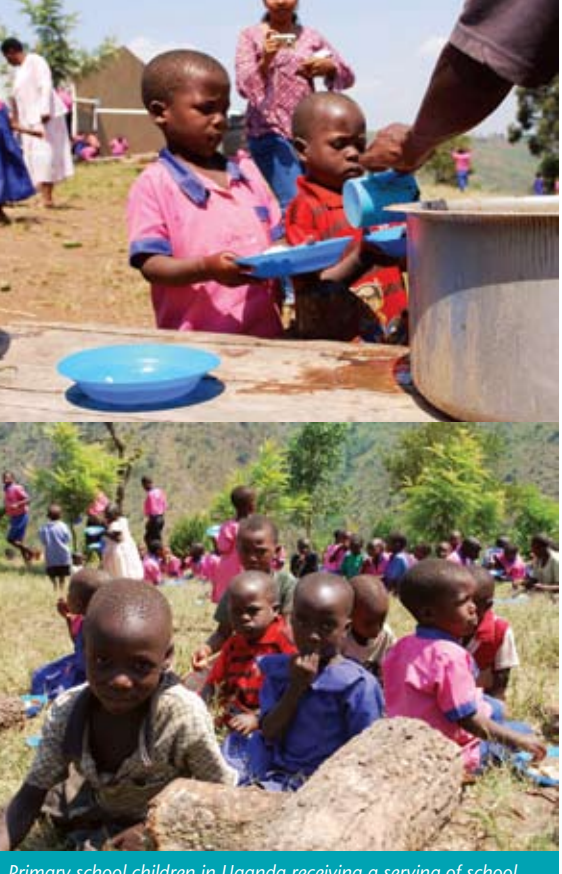
Primary school children in Uganda receiving a serving of school lunch served by TABLE FOR TWO.

In your travels to both developed and developing countries, can you share some impressions you have had when observing medical care and health systems worldwide?