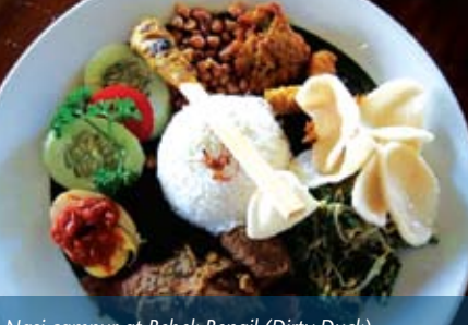
Nasi campur at Bebek Bengil (Dirty Duck)