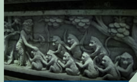
Dalem Agung Padangtegal temple at Monkey forest