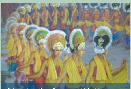
Rejang dance from Bungaya at Neka Museum