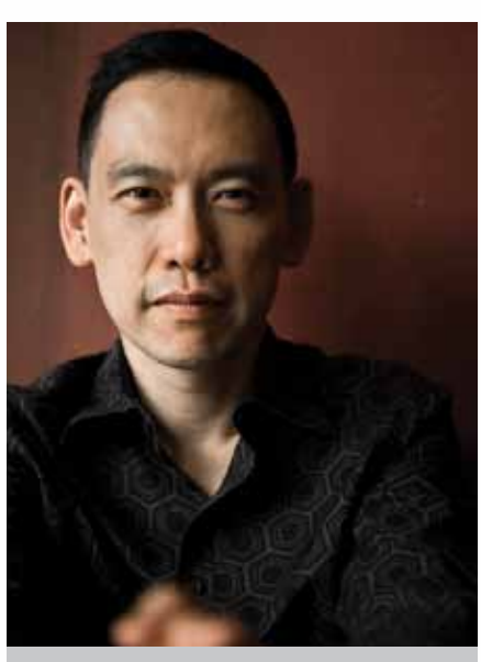
He has been in private practice since 1993 and has seen his fair share of the human condition. He pines for a good pinot noir, loves the FT Weekend and of course, wishes for world peace...

Ultimately patients are not gullible or stupid, and they can pretty much tell a mile away what your intentions or agenda are. On our part, we need to understand that despite the odds stacked against the patient in terms of information asymmetry, they do have rights, enough savvy and EQ to discern and figure out the truth. At that point in time, all your good intentions, ethical agenda and goodwill generated will help save the day. SMA