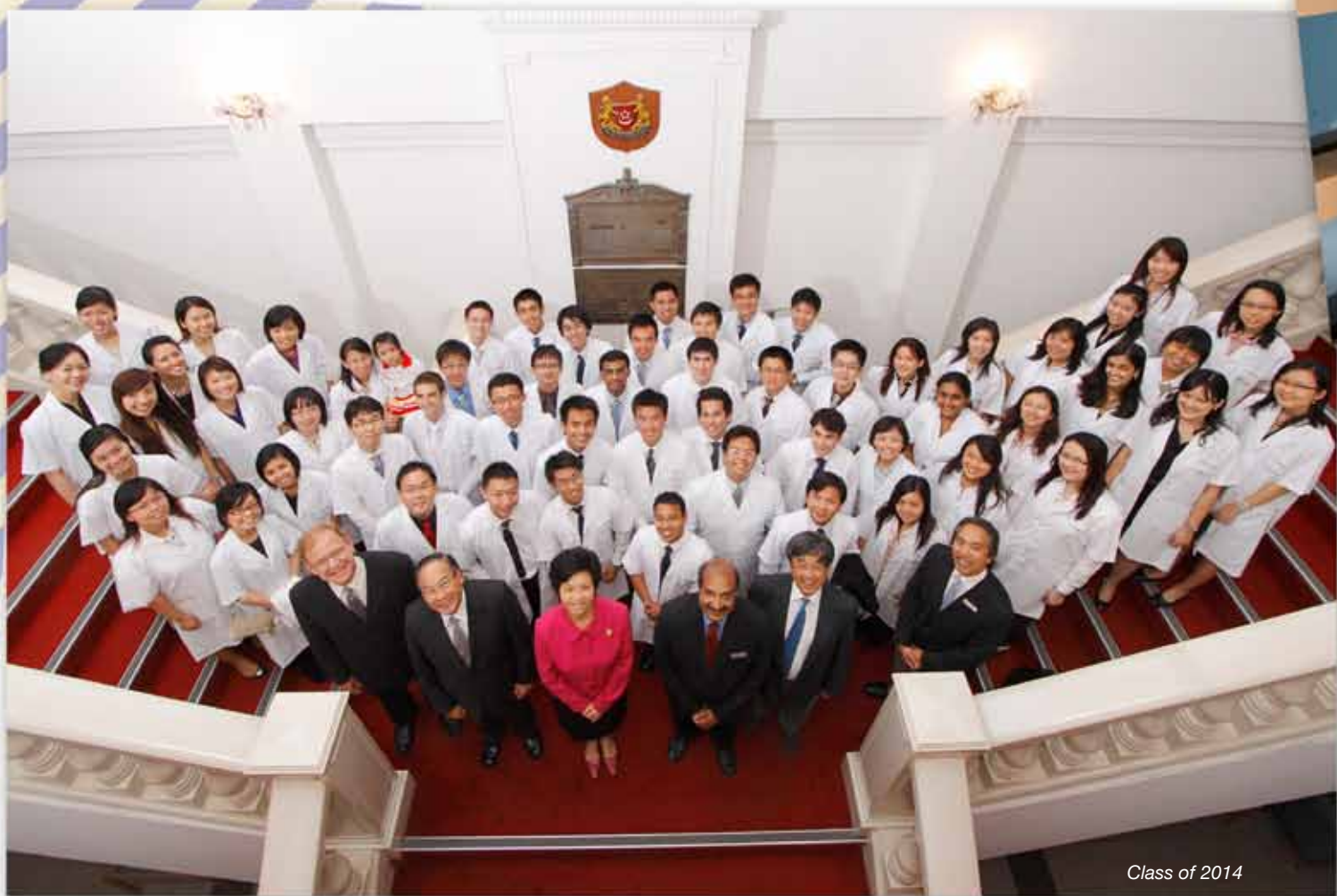
Class of 2014

A perennial symbol of physicians, the white coat also embodies the compassion to be afforded to patients, and the donning of which represents a student's entry into the calling of Medicine.