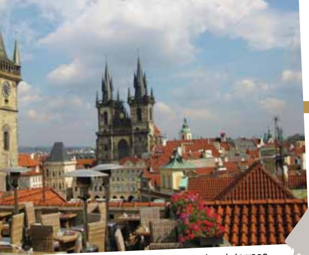
View of Old Town Square from lunch terrace

the formidable collection of 14th century Czech art, wall panels and altarpieces.