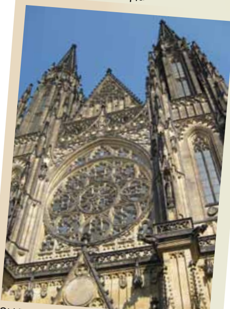
St Vitus Cathedral