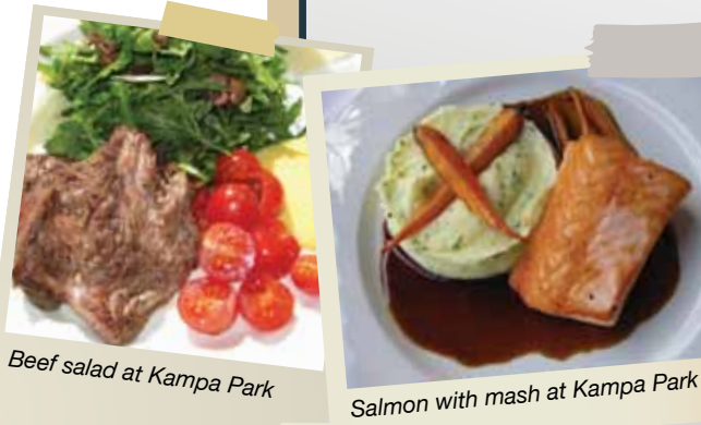
Beef salad at Kampa Park