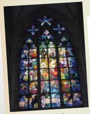
Alfons Mucha window