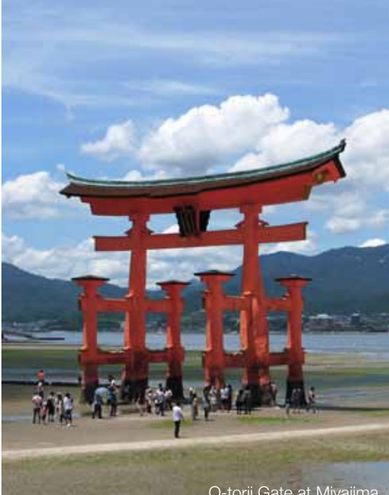
O-torii Gate at Miyajima

Would have been five, but a pesky deer made off with one