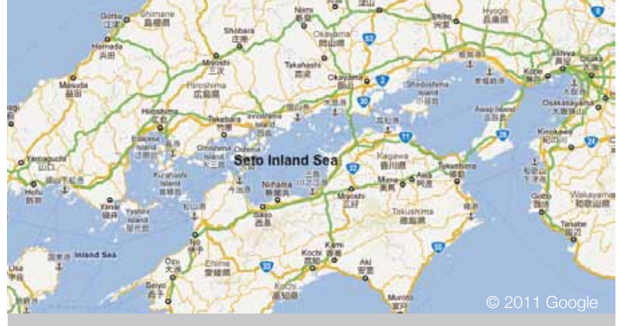
This is the fabled inland sea, a region rich in local colour and charm. Separating the islands of Honshu, Shikoku and Kyushu, this used to be one of the busiest transport lines in Japan during the Edo period. Often called "the land of fair weather", it is known for its moderate climate, so take some time to discover the fresh seafood and succulent produce borne of the surrounding prefectures and cities.

Gear up for a journey in search of tranquil nature and spectacular views, and fuelled with gastronomic delights, you might just make the best discovery of all – that of peace and contentment, as the blazing sunset dips into the inland sea.