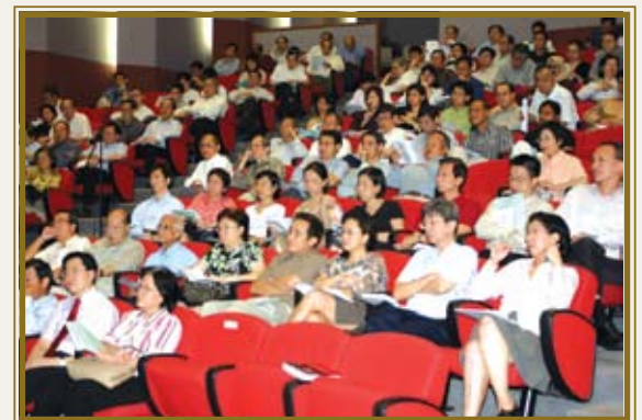
The Audience at the Flu Pandemic Workshop

GPs who are interested in the Primary Healthcare Response Framework can look out for more information in upcoming issues of SMA News.