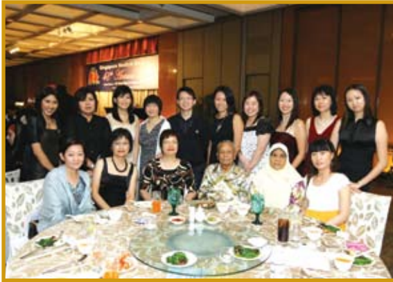
The SMA Secretariat