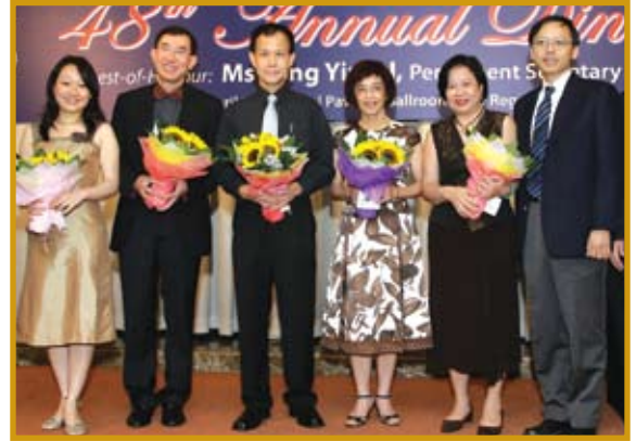
The Singing Doctors' Society

for their paper: “Expression of survivin and its clinicopathological correlations in invasive ductal carcinoma of the breast”.