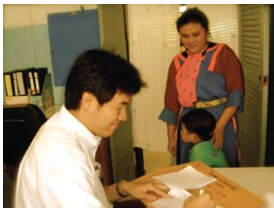
Outpatient consultation at rural hospital in Northern Thailand.

At the same time, globalisation also has its advantages. Many countries in Asia are richer from increasing global trade. New knowledge and technologies to improve health could be transferred to a much broader population at a faster pace. Increasing cross-cultural exchanges could also increase awareness of global and developing countries' health issues and improve the search for solutions. The caveat is that many of what you call the "have-nots" also lack access to basic education or healthcare that will enable them to benefit from such opportunities. There are also questions about the fairness of the global trade and economic system and rising concerns over the imbalanced growth that some population groups are left out of.