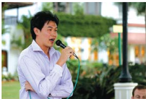
At the Asia Society's Asia 21 Young Leaders Forum.

PH: I think it could be both. Easier movement of people across national boundaries in the case of high-skilled health professionals is usually in one direction from poorer to richer countries and regions. A number of sub-Saharan African countries are suffering from medical brain drain such that their health systems are unable to provide essential services to the poor. In Thailand, the popularity of medical tourism led to what some senior health officials called a "virtual brain drain". More foreign patients with high capacity to pay promote growth of a premium hospital sector, which draws in specialists and doctors from other healthcare sectors. The result is a relative shortage of high-skilled staff in the public system especially in rural areas.