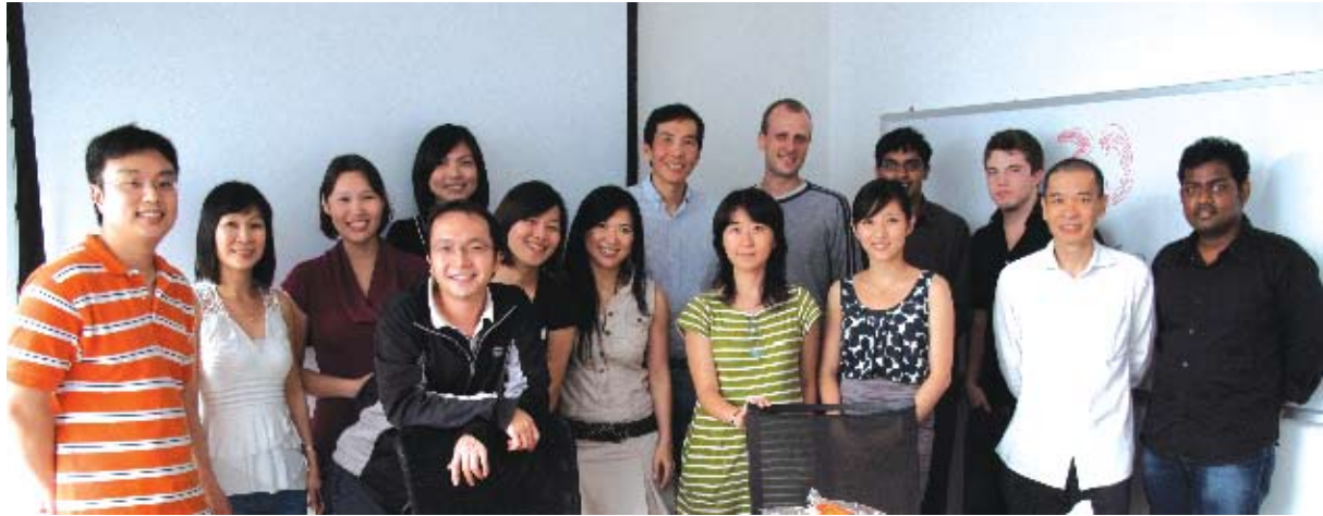
CNL Lab: Lab members of the Cognitive Neuroscience Laboratory at Duke-NUS Graduate Medical School enjoying a celebration.

So we should not be trapped in a system where decision makers merely look at the books and tell highly-skilled and dedicated persons that they are not earning their keep. Remember the Galois story? Well, I can tell you many more but we don't have space. Scientific ideas take time to mature and to generate revenue and the pay-line is unpredictable. That's the way life is.