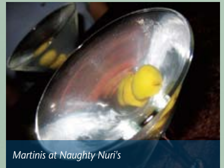
Martinis at Naughty Nuri's