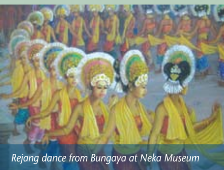
Rejang dance from Bungaya at Neka Museum