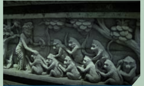
Dalem Agung Padangtegal temple at Monkey forest