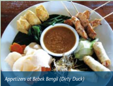
Appetizers at Bebek Bengil (Dirty Duck)