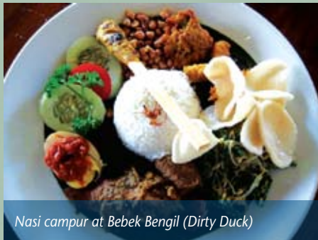
Nasi campur at Bebek Bengil (Dirty Duck)