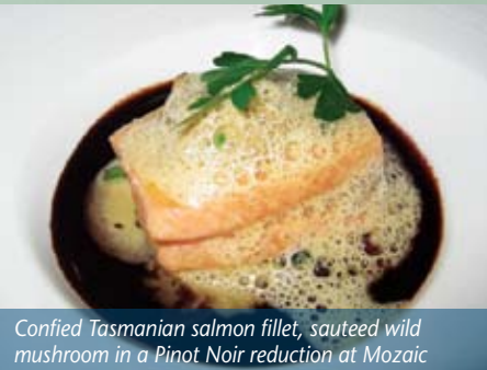
Confied Tasmanian salmon fillet, sauteed wild mushroom in a Pinot Noir reduction at Mozaic