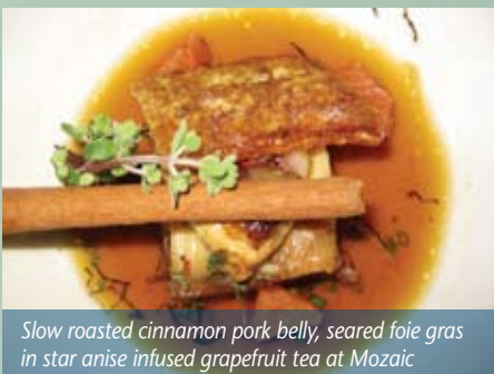
Slow roasted cinnamon pork belly, seared foie gras in star anise infused grapefruit tea at Mozaic