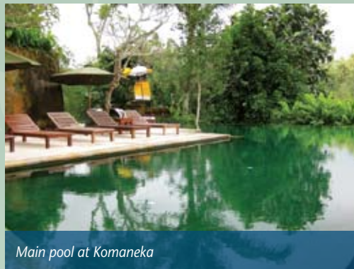
Main pool at Komaneka

Optimising long weekends has become a skill in its own right. For short breaks like this, there are many destinations within our region well-worth visiting. Taking into consideration the searing local weather, Bali was chosen to escape the crowd in September. There were many attractive accommodation offers on the Internet the Komaneka was finally agreed on.