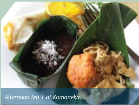
Afternoon tea 1 at Komaneka