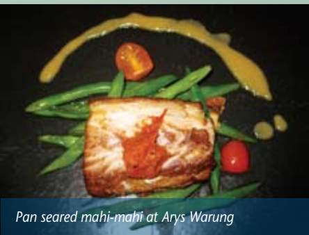
Pan seared mahi-mahi at Arys Warung