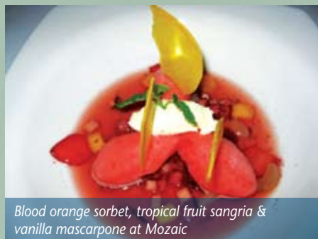
Blood orange sorbet, tropical fruit sangria & vanilla mascarpone at Mozaic