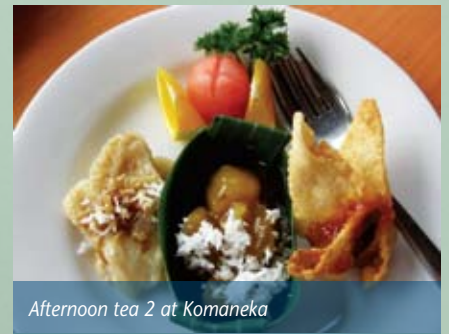
Afternoon tea 2 at Komaneka