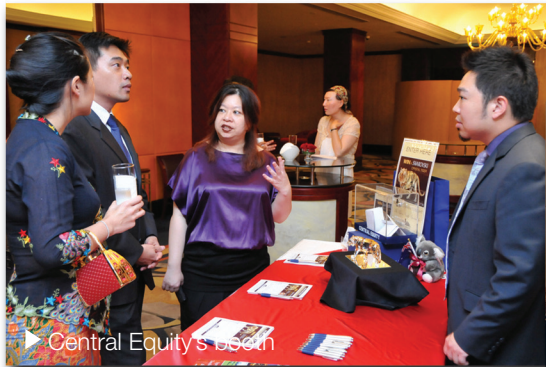
► Central Equity's booth