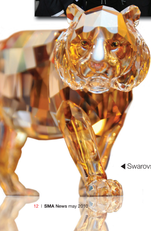
◀ Swarovski tiger prize by Central Equity.