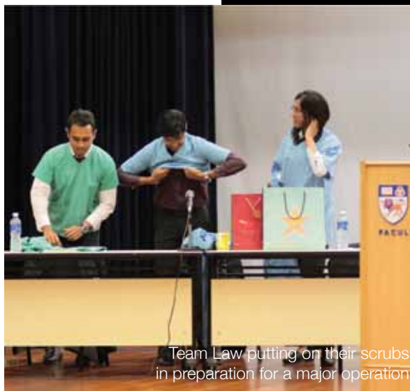
Team Law putting on their scrubs in preparation for a major operation