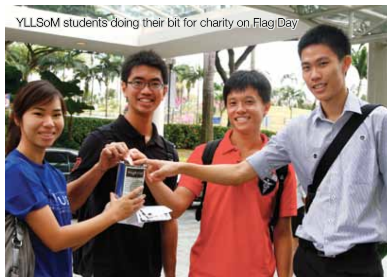
YLLSoM students doing their bit for charity on Flag Day