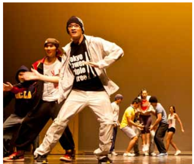
The M5s dance to a remix of LMFAO's "Party Rock Anthem"