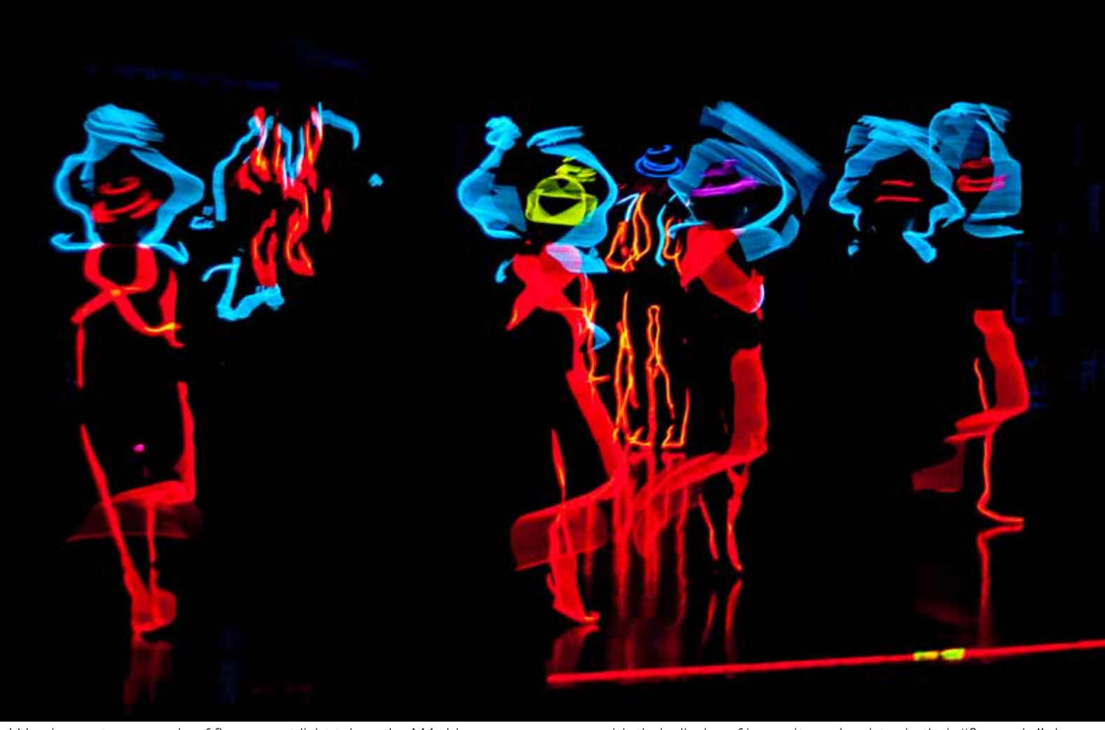
Wearing costumes made of fluorescent light tubes, the M4s blew everyone away with their display of ingenuity and artistry in their "fireworks" dance