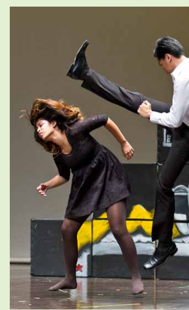
Fight between the Yakuza Lady Boss (Divya Ang) and the Mafia Boss Dimitri (Norhaliim Putera)