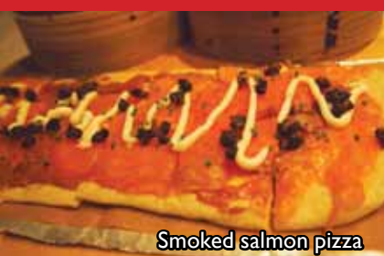
Smoked salmon pizza