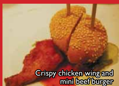
Crispy chicken wing and mini beef burger

Skyving Good Times was held on 11 April 2012 at Skyve Elementary Bistro & Bar. Tucked away in a quiet nook at 10 Winstedt Road, just behind Anglo-Chinese School (Junior), Skyve offers refuge from the hustle and bustle of the city.