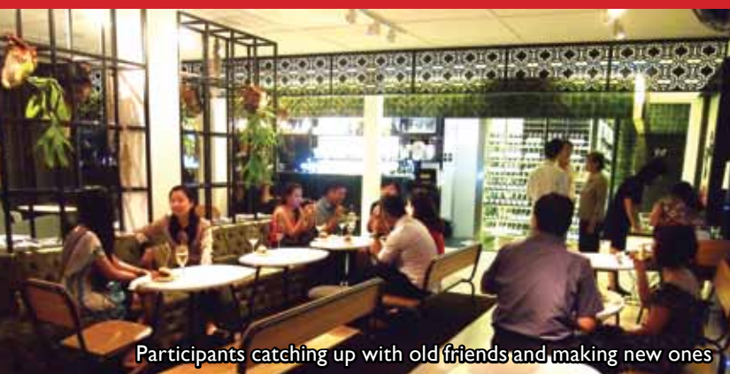
Participants catching up with old friends and making new ones