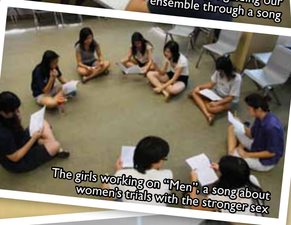
The girls working on "Men", a song about women's trials with the stronger sex